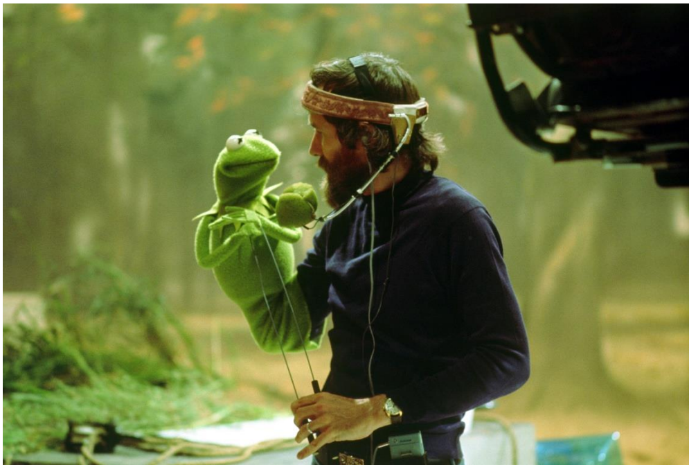
Jim Henson and Kermit the Frog