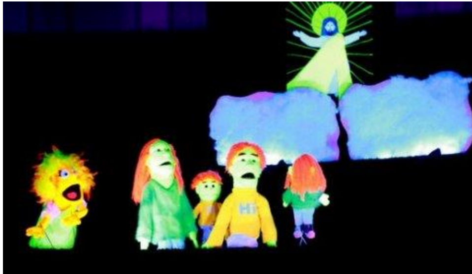
Black Light Ministry at First Baptist Church Alma in Georgia