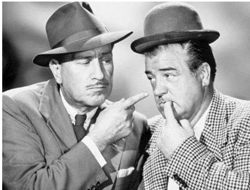
Abbott and Costello