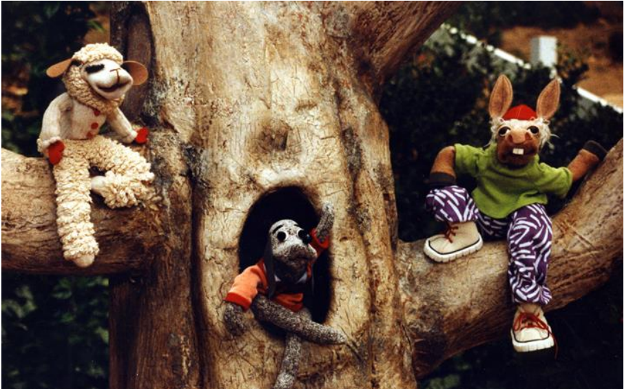
Shari Lewis' Lamb Chop's Play-Along on PBS