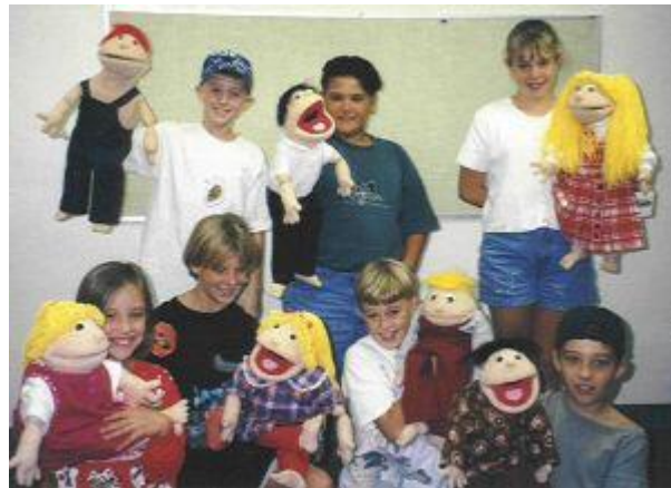
Members of Fielder Road Puppet Ministry in Texas